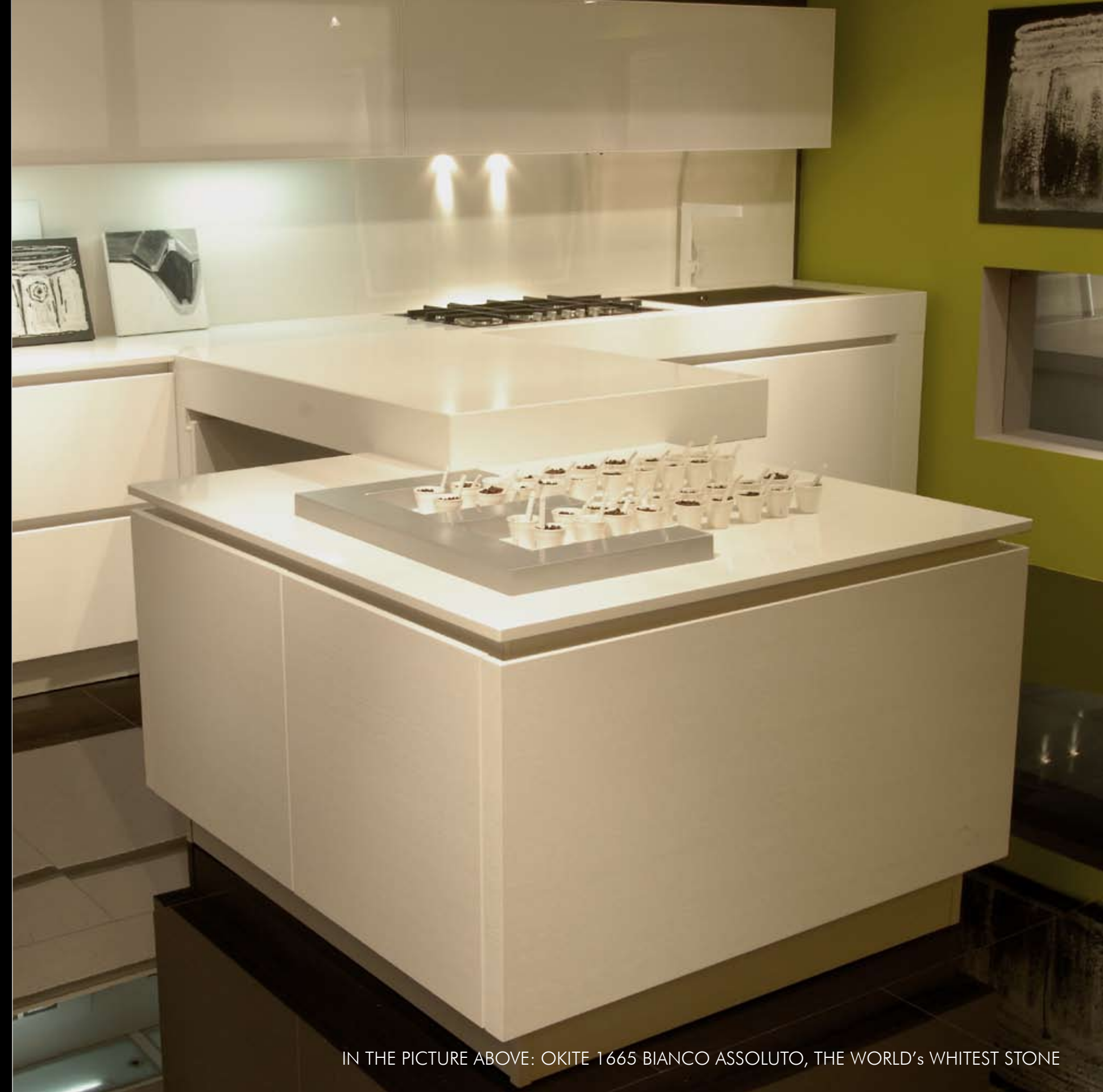
IN THE PICTURE ABOVE: OKITE 1665 BIANCO ASSOLUTO, THE WORLD'S WHITEST STONE

Our Product Binders have been designed to serve as an organized reference guide. Each binder contains 2” x 2” and 2” x 4” samples. Binders Requests will take approximately 5-8 days for shipping. Our standard delivery is Ground at no cost to you.