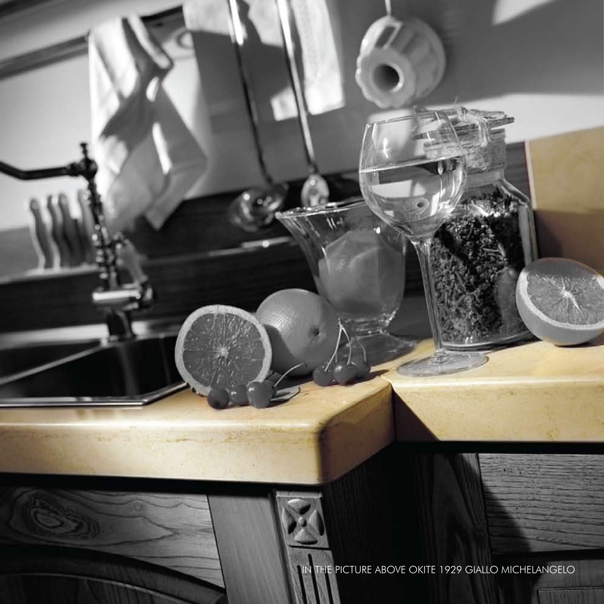
IN THE PICTURE ABOVE OKITE 1929 GIALLO MICHELANGELO