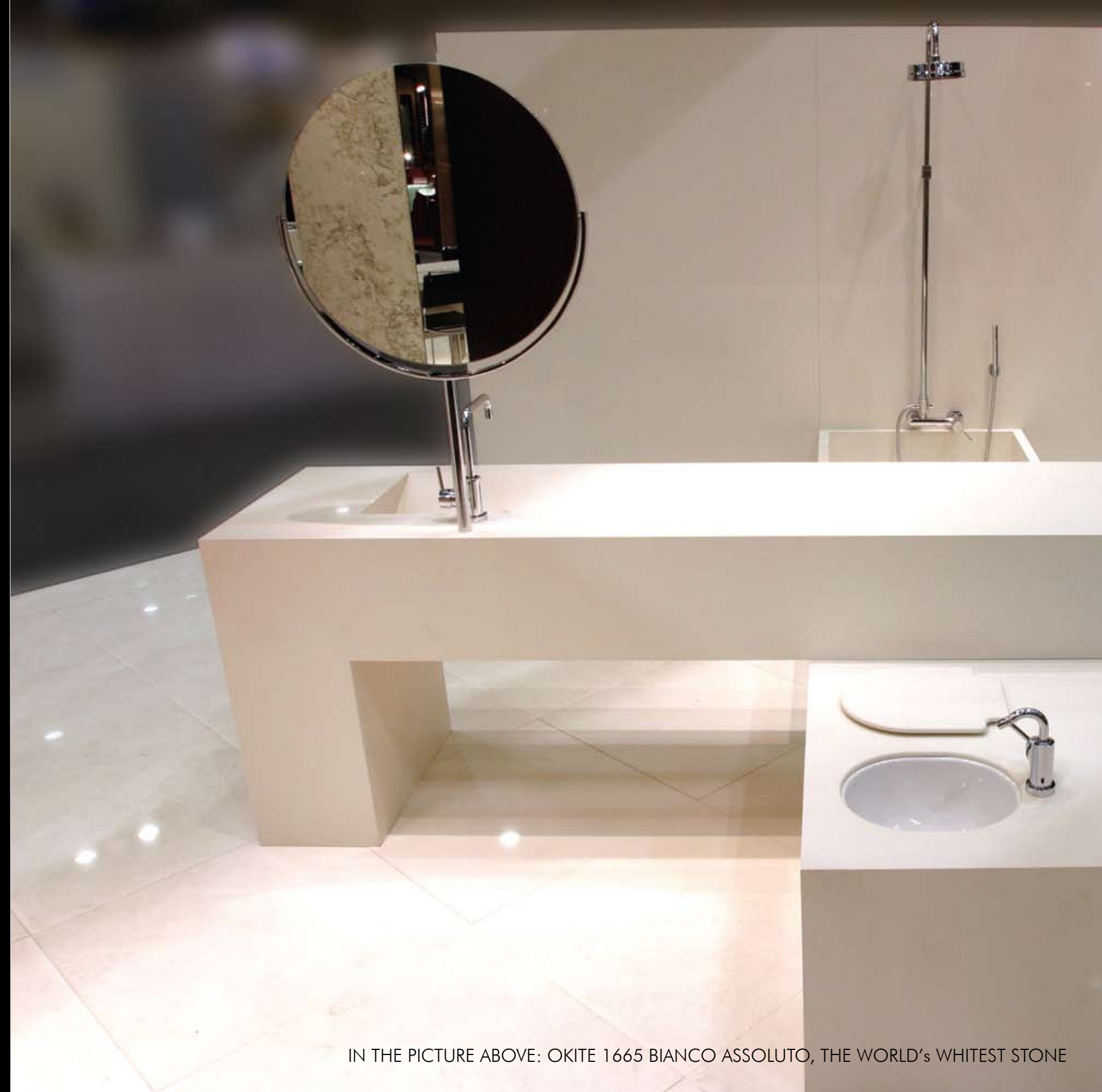
IN THE PICTURE ABOVE: OKITE 1665 BIANCO ASSOLUTO, THE WORLD'S WHITEST STONE